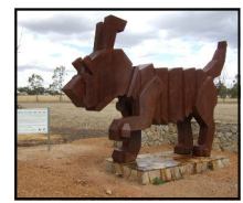
Tin Dog at Dowerin. A reminder of mining.