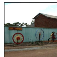
Wheels of Progress, Wyalkatchem