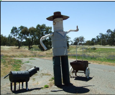
Tin Man @ Mirrool

On the 22nd of October, we left for Dubbo, NSW in order to meet some of the most innovative minds in farming. On the way a tin man and his tin dog caught our eye so we stopped to